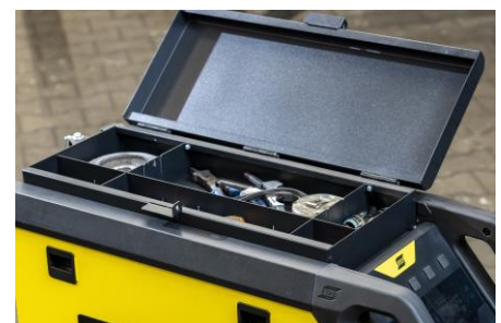
Optional top toolbox for accessories