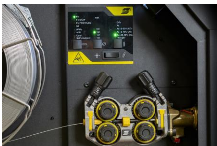
Best in class wire feeding mechanism