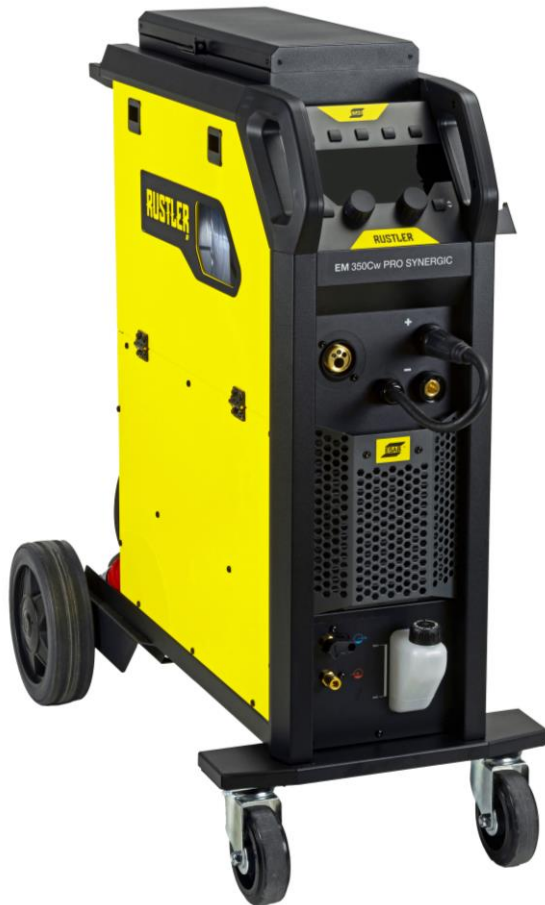
Rustler EM 350Cw PRO Synergic

Rustler MIG PRO compact welding inverters are your solution of choice for the most common welding challenges. Equipped with the latest inverter technology, they combine low energy consumption with optimized welding performance.